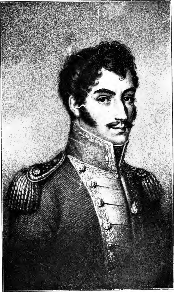
SIMON BOLIVAR The Liberator